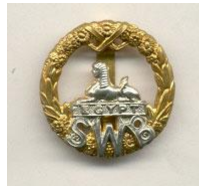
Cap Badge of the South Wales Borderers showing the Sphinx 24 th Regiment of Foot