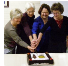
All above Photos courtesy of Ian Barnes